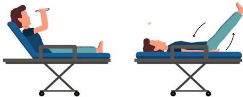
Step 1: Patient forcefully blows into 10 mL syringe while semi-recumbent (~45°)